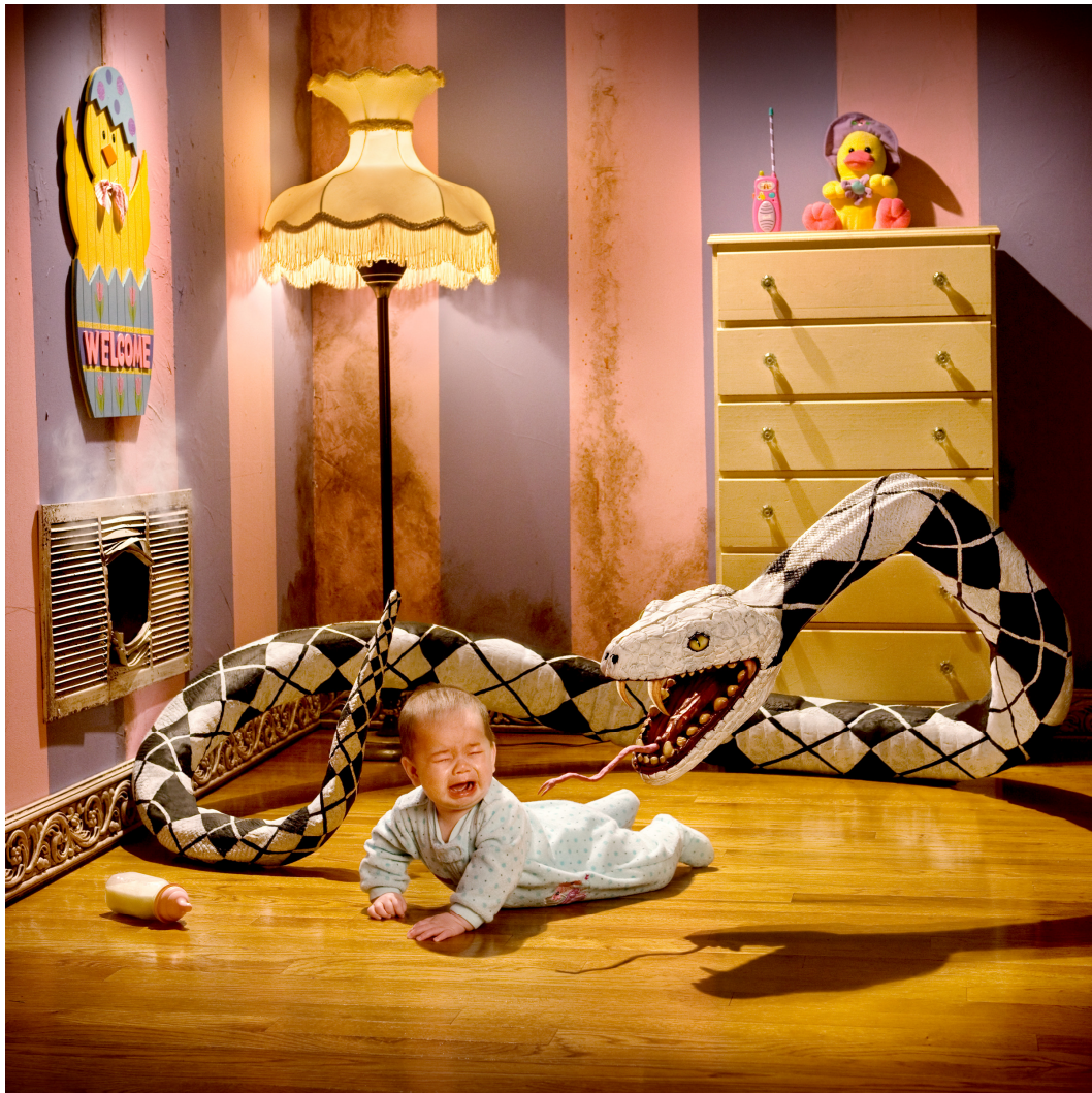
Caption: Snake by Joshua Hoffine, www.joshuahoffine.com (permission to reproduce granted by the artist).

The zombie taps into deep-rooted, ancient fears that extend far back into our hominid lineage and beyond: notably the fear of contagion and the fear of predation. Humans are equipped with ‘elementary feature detectors geared to respond to biologically relevant threats,’ as Arne Öhman has spent a life of research demonstrating (2000, 587), and we react strongly and predictably to features that seem to represent ancestral dangers, even when the source is only a