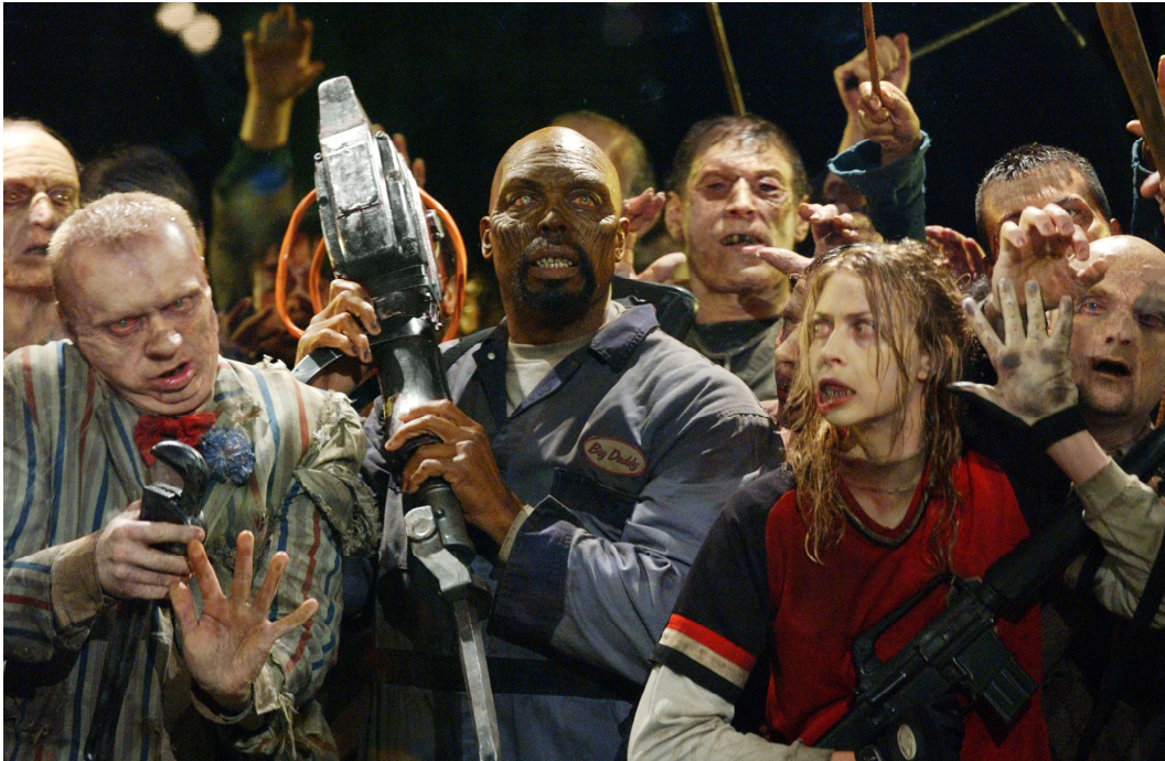
Caption: Image from Land of the Dead (2005).

People instinctively know to avoid the kind of toxic substances that over evolutionary time constituted a lethal threat to our ancestors, such as rotting meat. That's because natural selection has fine-tuned our perceptual apparatus to be on alert for such substances: those of our ancestors who cried yuck at the sight of decomposing flesh were more likely to propagate their genes than the ones who dug in happily. Over time, the rot-lovers became extinct, and the human population today is united in its innate aversion to spoiled meat. This is an experiment you can do at home: purchase a packet of steaks, let it sit on the kitchen counter for a week and a half, and then open it and smell the roses. If your response is less than enthusiastic, that's natural selection protecting your genetic material from a potent threat, right there.